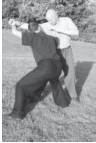
(3) He then lowers his body as he enters with an elbow strike to the mid-section of his opponent.