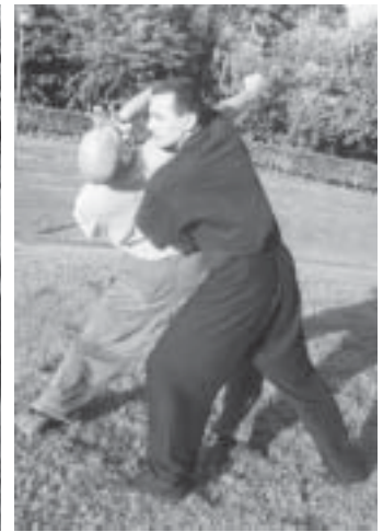
(4) He finishes with his right arm coming over the top to 'cover' the face of his opponent, taking him backwards.