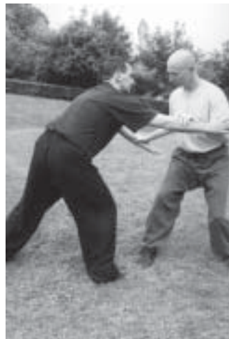
(3) Pulling down and forwards