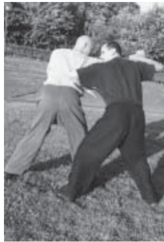
(3) which then turns into a grab enabling him to step to the outside striking the ribs with his forearm.