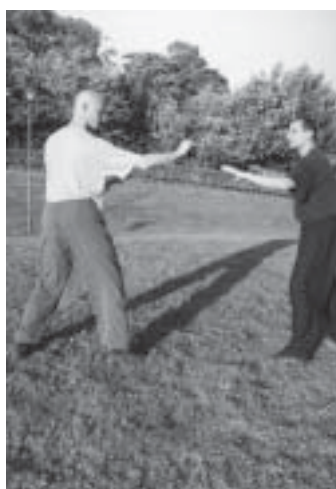
(1) Faced off.