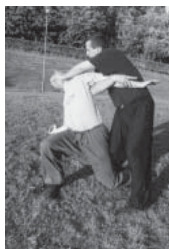
(4) He then follows up with a palm strike/push to the face.