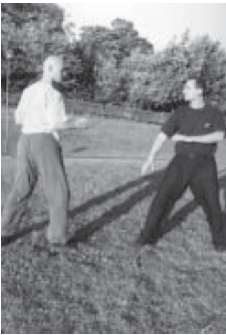
(1) Faced off.