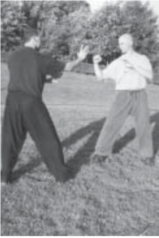
(1) Faced off.