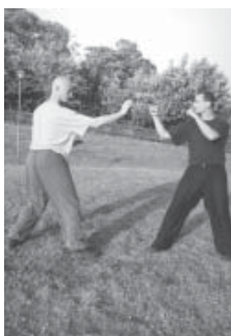
(1) Faced off.