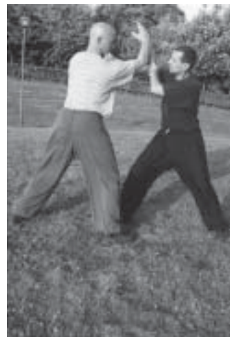
(4) Using the forward pressure from Luigi's blocking hand, Aarvo pulls that hand across which frees his lead arm for another chop.