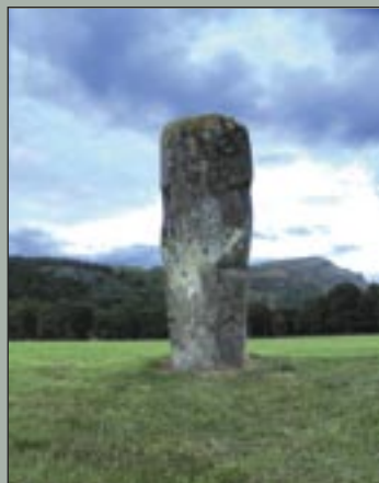
Standing Stone on campus