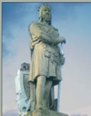
Robert the Bruce