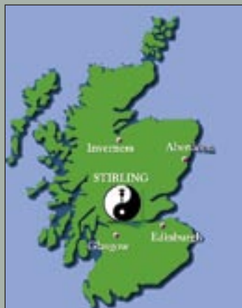
In the Heart of Scotland