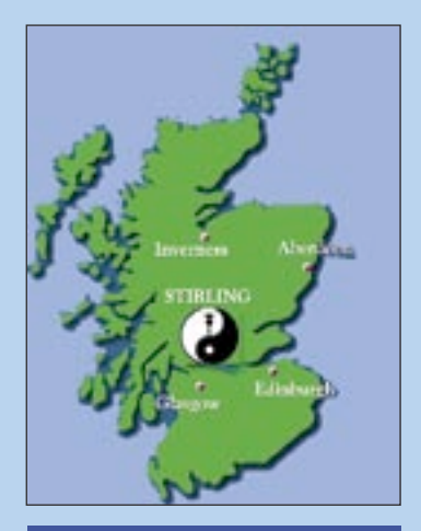
In the Heart of Scotland